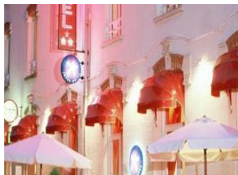
Hôtel New Providence 2**