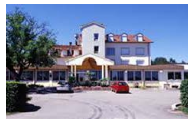
L'Orée du Bois 3***

Attractive hotel in the heart of the city 1 km far from the Competition Centre