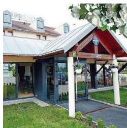
Time Hôtel 2**

In the heart of a beautiful landscape Jacuzzi / Fitness / Sauna / Solarium 3 kms far from the Competition Centre