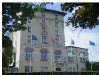
Hôtel-Club Cosmos 3***

Indoor swimming pool – Hammam 3 kms far from the Competition Centre