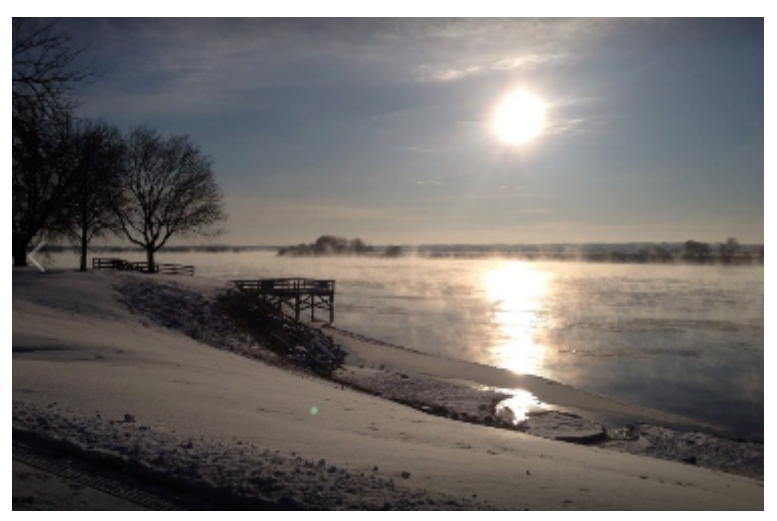
Missouri National Recreational River