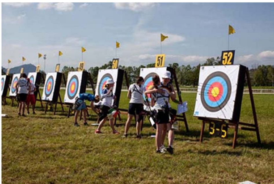
Ljubljana, EYC 2014